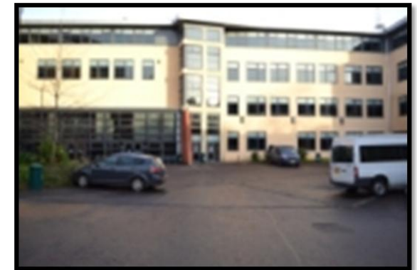
St Thomas of Aquins School, Back Entrance