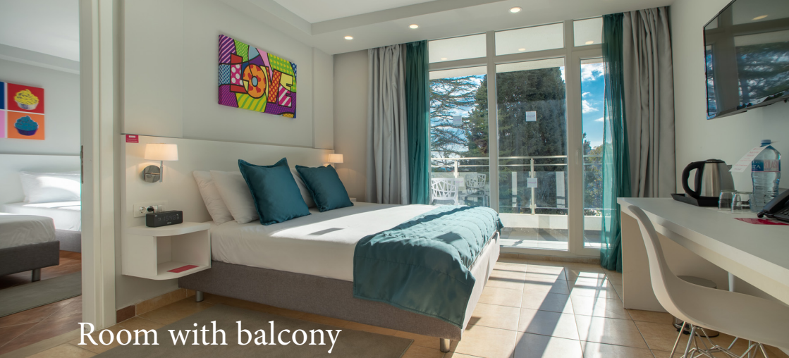
Room with balcony