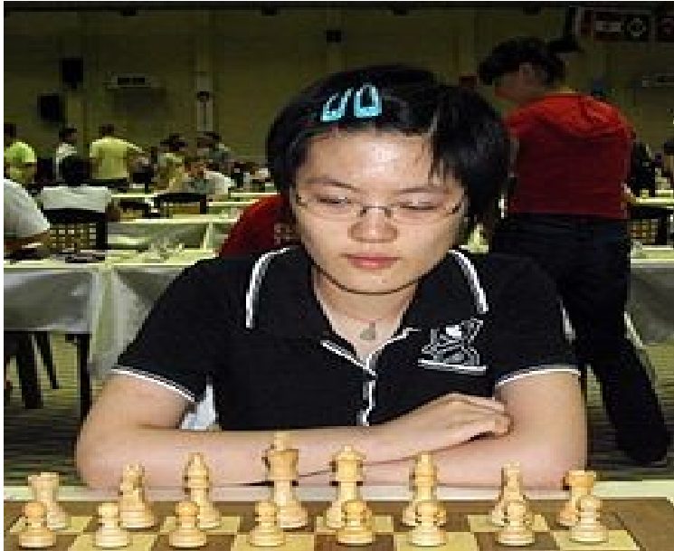
Women World Champion GM Hou Yifan

For the second straight year, the WOM elected the best player of 2010. The winner was Reigning Women World Champion GM Hou Yifan from China and it was decided by the votes received. GM Yifan will be awarded a statue and prize money.