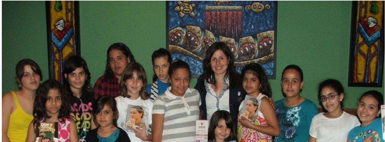
Simultaneous Exhibition and material donation in Puerto Rico 2010

In 2010, several good-will events such as lectures, simuls, material giving were held in United States, Puerto Rico and Ecuador