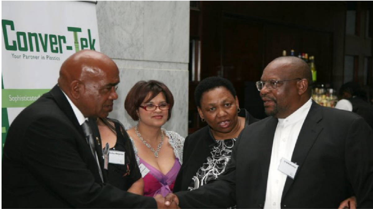
On the far right: Dr Mathole Motshekga ANC Chief Whip. Next to him is his wife, the Minister of Education in South Africa Angie Motshekga at the launch of the Moves for Life chess program.