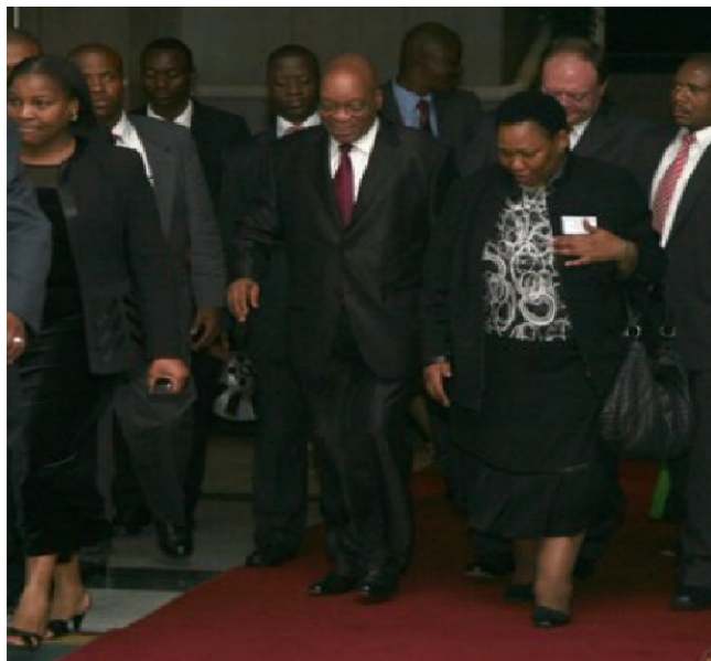
President Jacob Zuma and Minister Angie Motshekga at the Moves for Life launch.