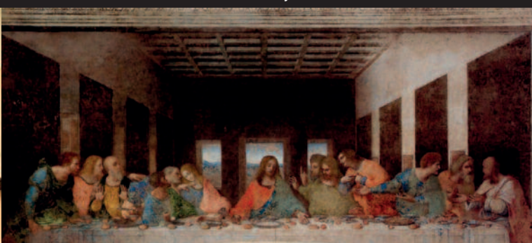
10. S. Maria della Grazie and Da Vinci's Last Supper