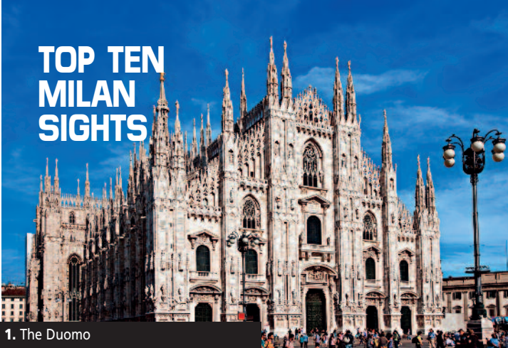
1. The Duomo