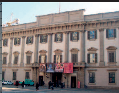
8. Royal Palace