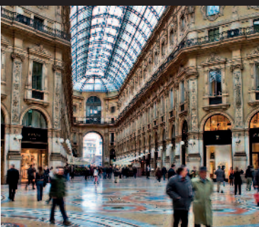
6. Galleria Vittorio Emanuele