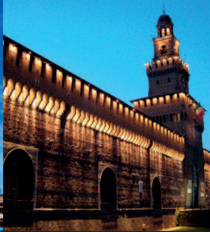
2. Sforzesco Castle