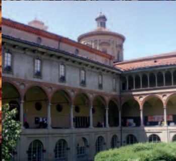
4. The Museum of Science & Technology