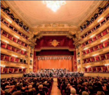
3. "La Scala" Theatre