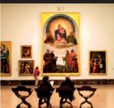
9. The Art Gallery of Brera