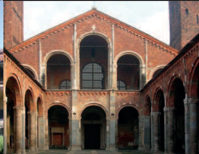
5. The Cathedral of S. Ambrogio