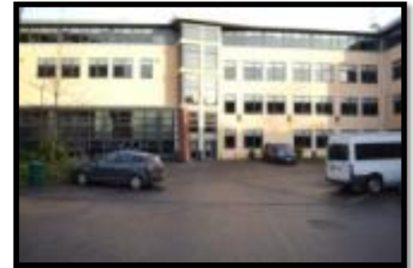
St Thomas of Aquins School, Back Entrance