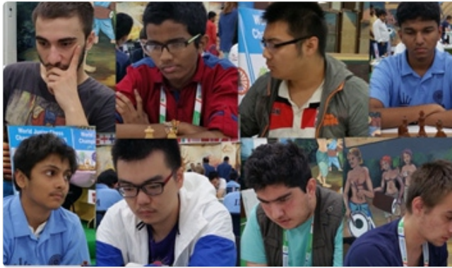
IM norm achievers