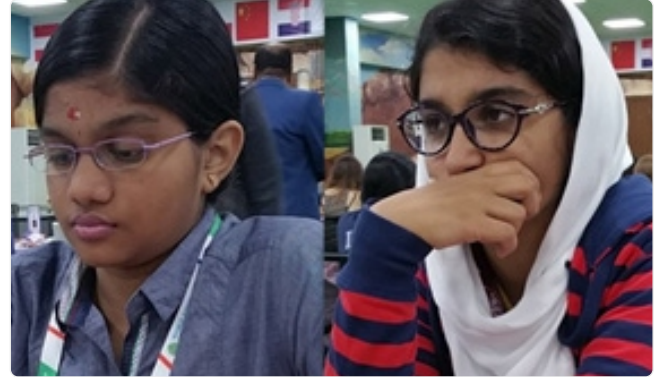
WIM norm achievers