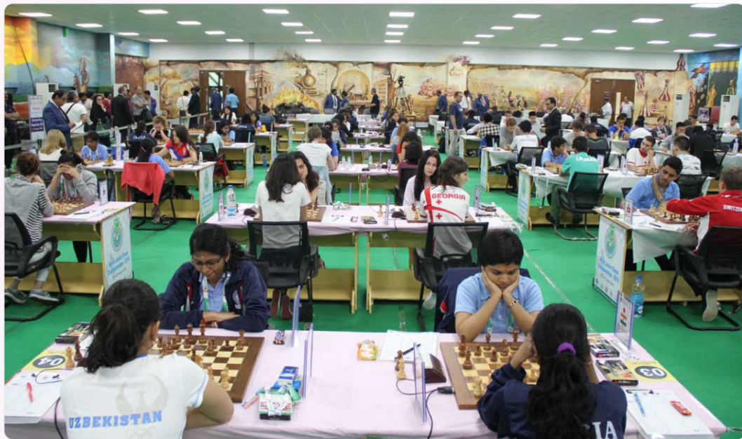
A view of the beautiful tournament hall, adorned with pictures depicting the culture of Odisha