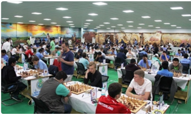
Beginning of second round