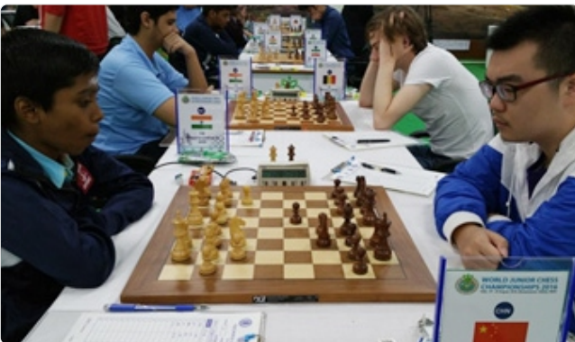
Fight between two Fms Praggnanandhaa R (India) and FM Xu Yi (China)