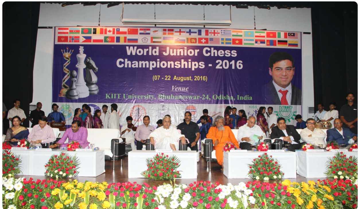
Dignitaries on the dais during inauguration