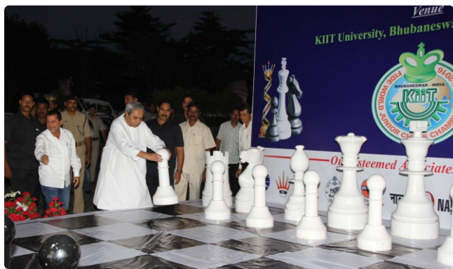
Honourable Chief Minister Shri Naveen Patnaik makes the ceremonial first move on 7 th July