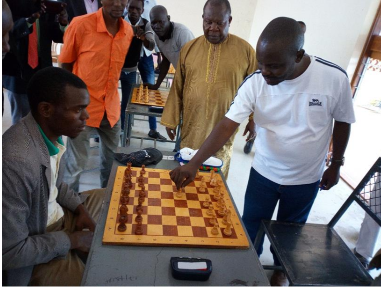
Official opening "e4"