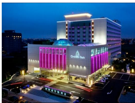
Official hotel Orchard Park (5★)

11.1 The Official Hotel is Orchard park hotel, Taoyuan, Taiwan